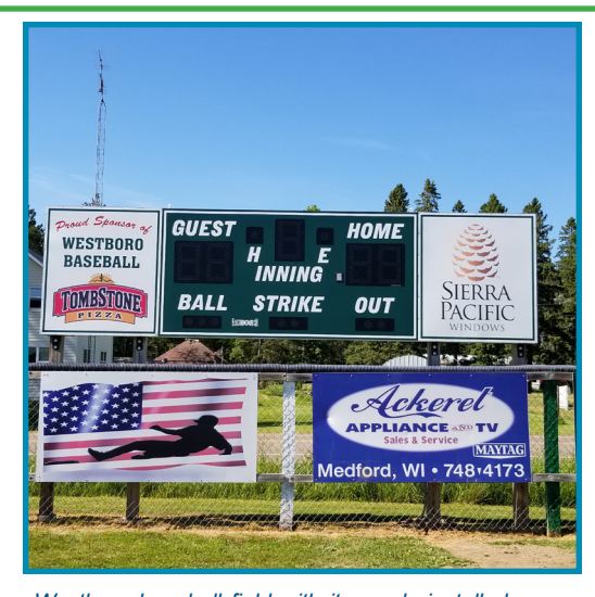
Westboro baseball field with its newly installed score board. Proudly showing off our SPW logo. The foundation joined with other local business and co-sponsored this scoreboard.

The 2021 baseball season will be an exciting one for citizens in our Medford WI, operating community. Not because Covid-19 restrictions are lifted (though that is exciting), but thanks to the Sierra Pacific Foundation for generously donating to help two different ballfields purchase new scoreboards.