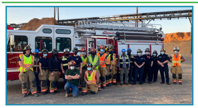
Fire crews from two stations pause from a training exercise hosted at our Burlington sawmill for a photo with a few SPI crew.