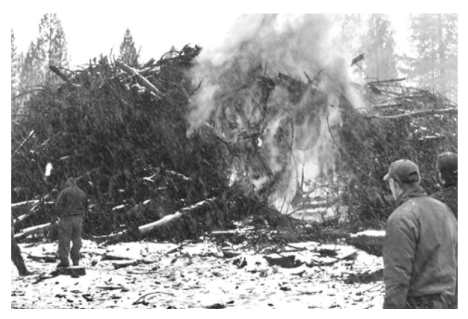
Figure 1. Open pile burn of forest fuel treatment woody biomass in Lake Tahoe Basin.

The Placer County Air Pollution Control District (PCAPCD), with responsibility for managing air quality in Placer County, shares regulatory authority over open burning with local fire agencies. Open burning is problematic because of the limited time of year it can be conducted, subsequent monitoring of smoldering piles for days after they are lit, and the production of significant quantities of air pollutant emissions and esthetically unpleasing residuals (blackened logs and woody debris). The PCAPCD expends significant resources reviewing smoke management plans, issuing burn permits, inspecting burn piles, and responding to complaints from smoke.